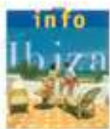
Sign and literature holder