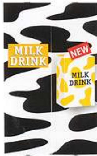
Two or more panels can be joined with magnetic tape