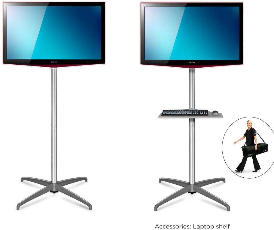
Accessories: Laptop shelf